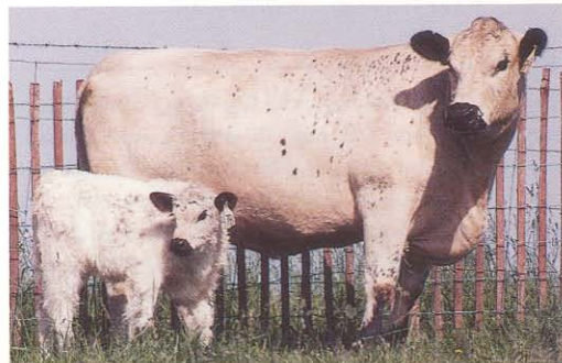
White Galloway cow in her summer coat with calf